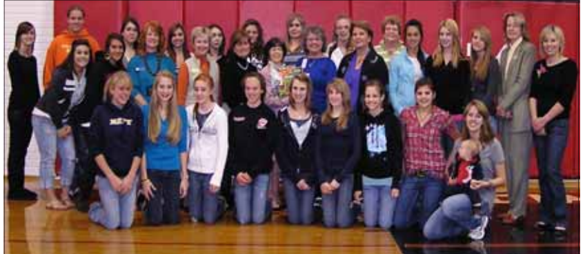
Photo Above Right:

The next step for this Make a Difference Day Event: On November 19, ASTRA Members and Altrusans presented sets of three books about global warming, carbon footprint and green living from the Literacy & Environmental committees for all District middle school and high school libraries as well as the Montrose Library and the Boys and Girls Club.